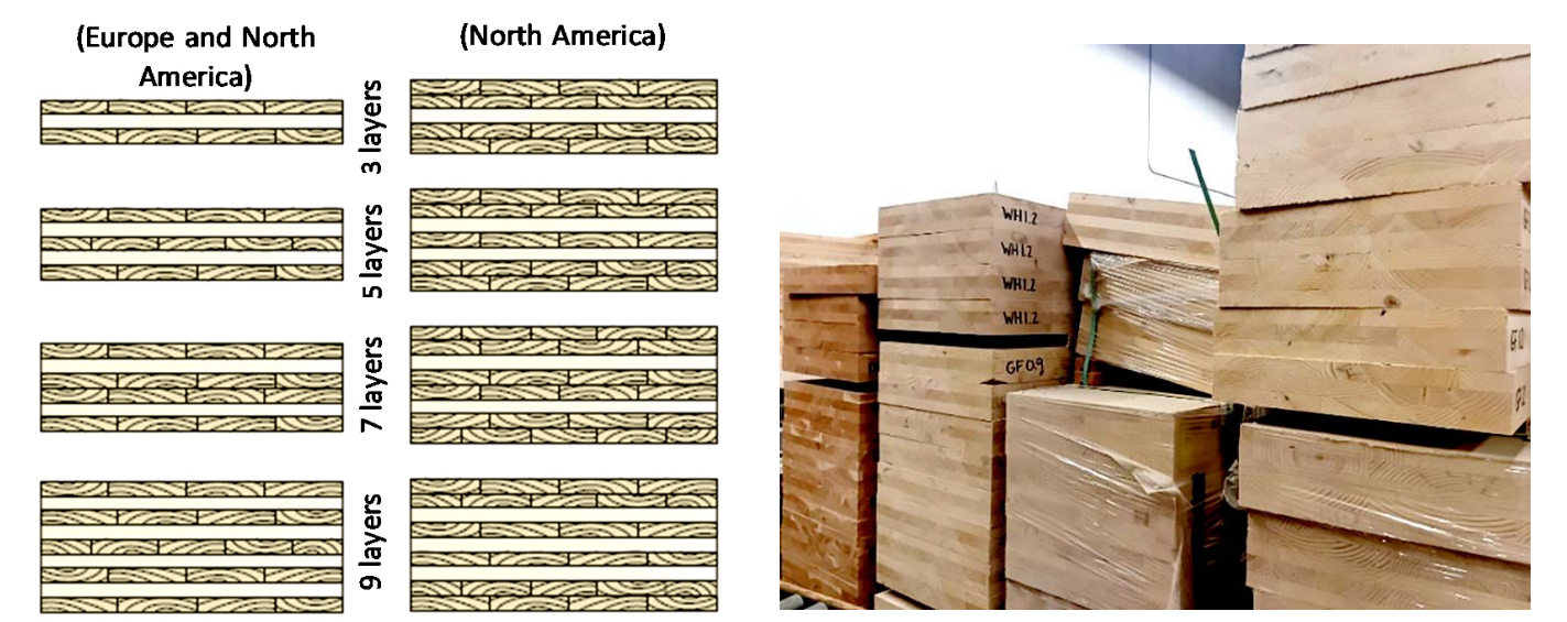
Examples of variations of CLT arrangement and design in Europe and North America (no permission needed).

CLT design considers the responsible sourcing of timber, adherence to environmental certifications, and efficient material usage. The design process aims to optimise resource utilisation, reduce waste, and promote circular economy. Overall, the methodology and design of CLT prioritise structural integrity, safety, energy efficiency, and sustainability, offering architects' and engineers' versatile and environmentally-friendly building materials to create innovative and resilient structures.