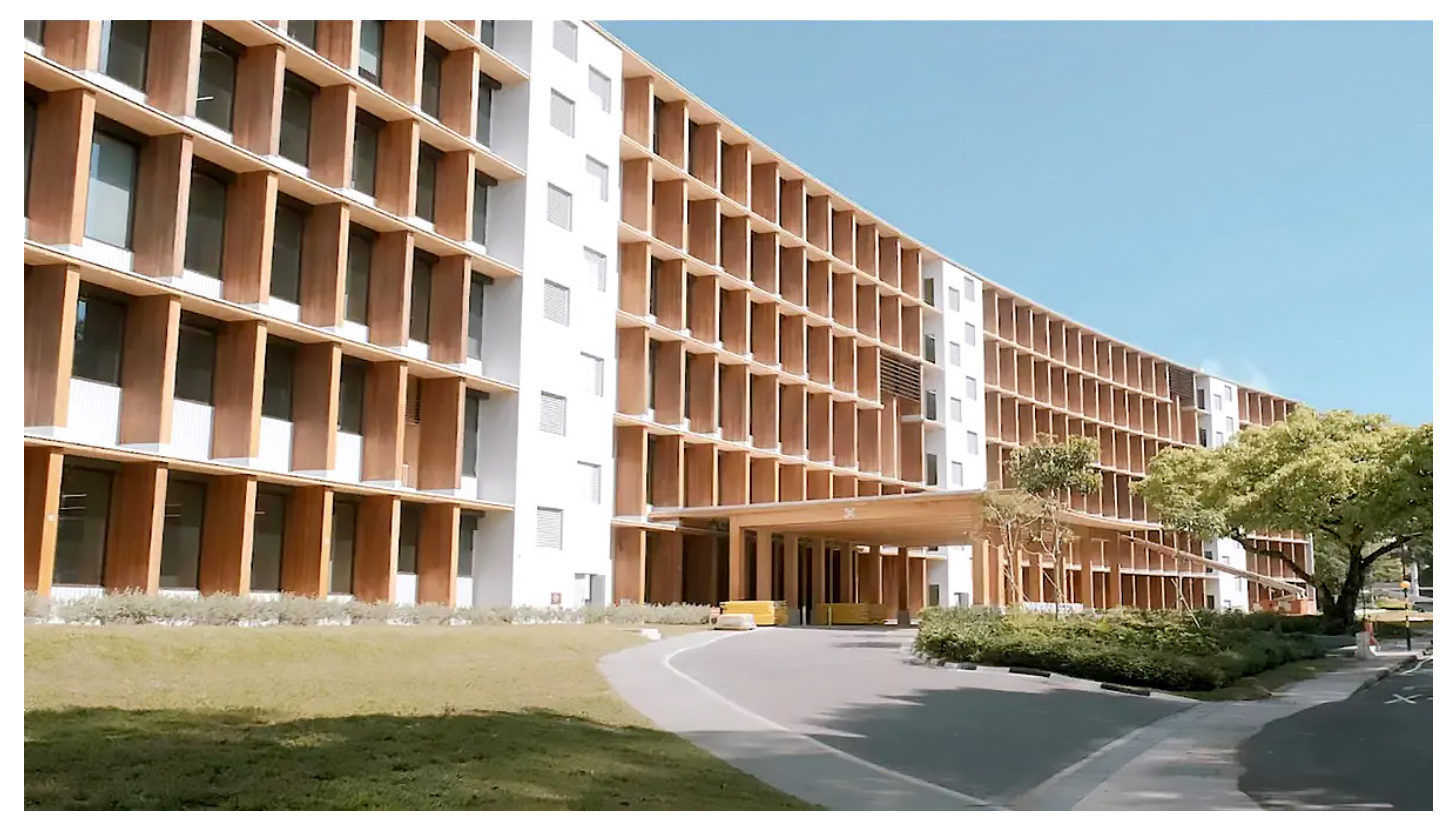
Gaia - Asia's largest wooden building sets the new sustainable standard in Singapore (Shama Shejal (2023) - https://interestingengineering.com/innovation/asias-largest-wooden-building )

The adoption of CLT can significantly support Malaysia's sustainability goals. It promotes economic growth by utilising the country's abundant timber resources, strengthening the timber industry, and creating job opportunities. The widespread use of CLT in construction projects can help address Malaysia's housing needs, especially for affordable and sustainable housing. Having rapid construction capabilities, cost-effectiveness and energy efficiency make CLT an ideal choice indeed.